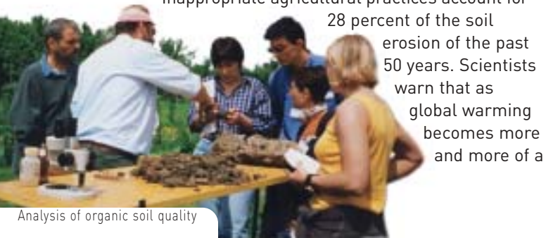
Analysis of organic soil quality

Because organic farmers do not use synthetic nutrients to restore degraded soil, they must concentrate on building and maintaining soil fertility primarily through their basic farming practices. They depend on multicropping systems and crop rotations, cover crops, organic fertilizers and minimum tillage to maintain and improve soil quality. The natural fertilizers they use, such as green manure, farmyard manure, compost and plant residues, build organic content and increase the soil's capacity to circulate nutrients, air and water. As crops use soil nutrients, they can be replaced with natural rock