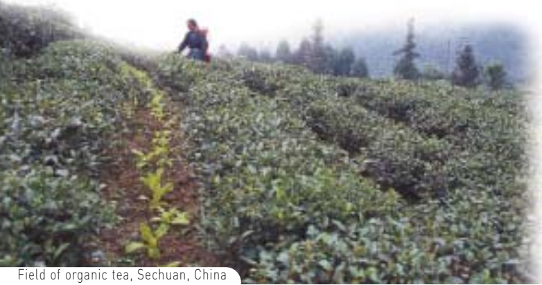
Field of organic tea, Sechuan, China

minerals such as potassium, phosphate, calcium, magnesium and other trace elements from external sources. Organic agriculture stresses careful management to meet crop needs and avoid excess application of manure and other organic matter that could cause nitrate leaching.