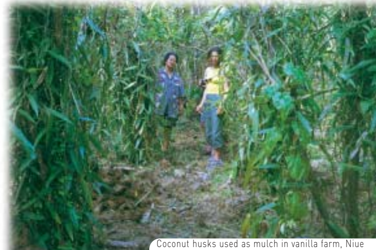
Coconut husks used as mulch in vanilla farm, Niue

(carbon dioxide, nitrous dioxide and methane). Moreover, mixed farming and soil building allow for increased biological activity by providing support for micro-organisms, earthworms, fungi and bacteria. Soils enriched with fauna and flora not only increase nutrient cycling and agricultural productivity but stabilize soils against erosion and floods, detoxify ecosystems and may even help counteract climate change by restoring “soil’s capacity for carbon sequestration”.