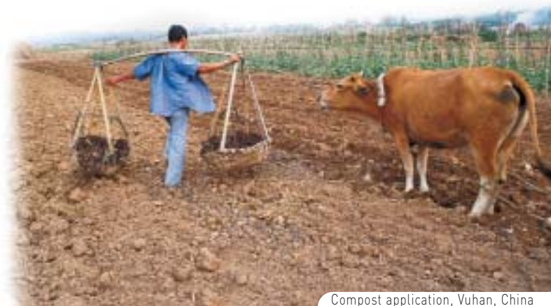
Compost application, Wuhan, China